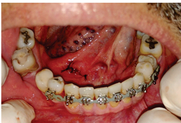
Figure 4. Clinical appearance of the site after suture.